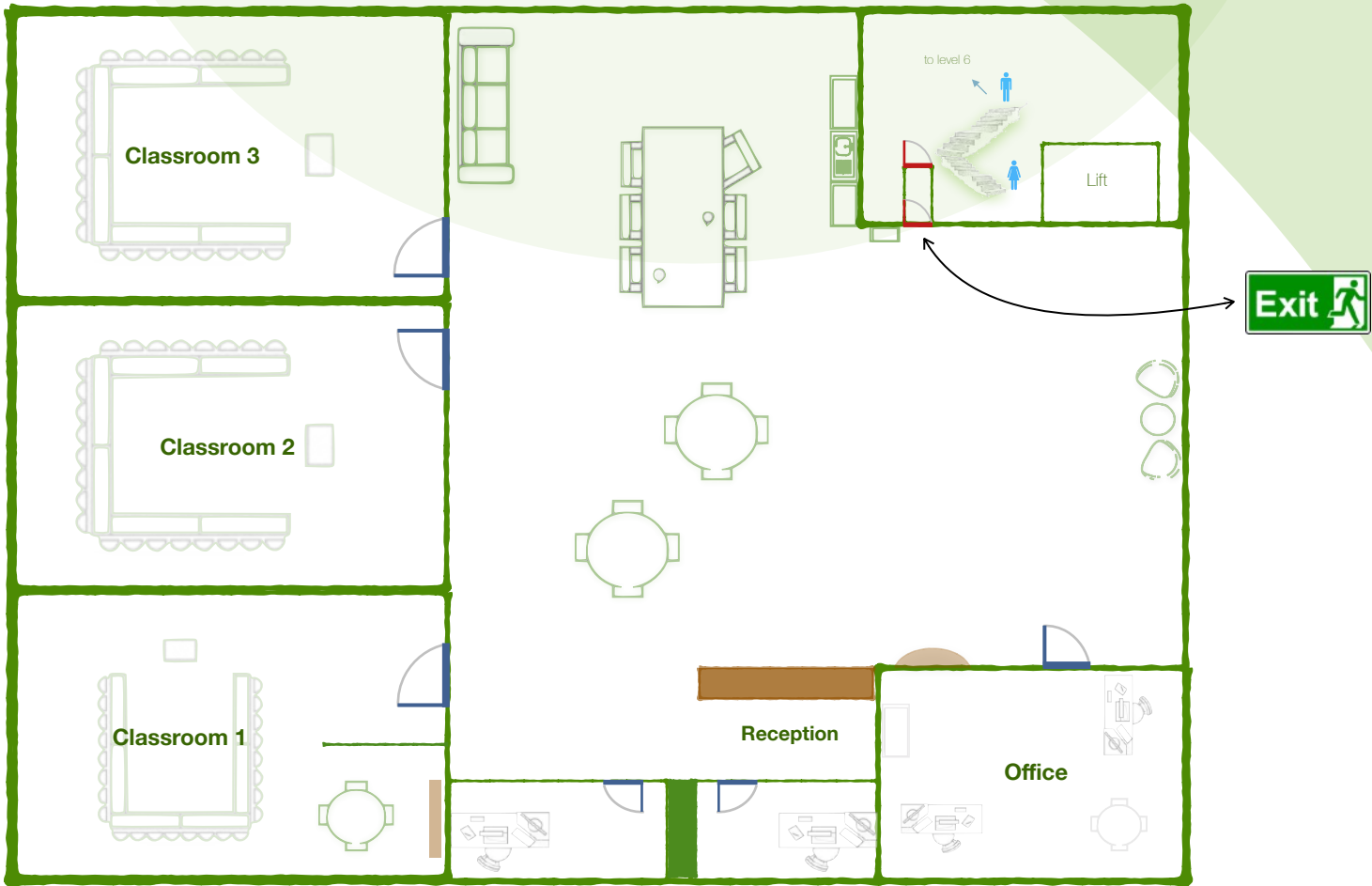
Level 6 - Classrooms